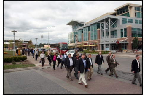
Akron business and community leaders tour Aksarben Village, an 80-acre development on the former site of a racetrack during the Greater Akron Chamber InterCity Leadership Visit in Omaha. The area next to the University of Nebraska Omaha has 4,000 residents, 5,000 workers, 17 restaurants and a second hotel being built. It also includes a grocery store and movie theater.

"The beauty of Omaha lies in its relationships. They've built a tightly woven network intertwining business, government, education, the arts and its non-profit sectors all working in concert under a master plan that is focused, funded and sustainable. The private sector appears to be a highly active, highly engaged partner, both leading and supporting the long-range viability of their community. Greater Akron is poised to leverage existing collaborations and engage our business community in new and different ways. Successfully identifying, refining and implementing a few key strategies will enable us to create more vibrant future for ourselves," Shapiro concluded.