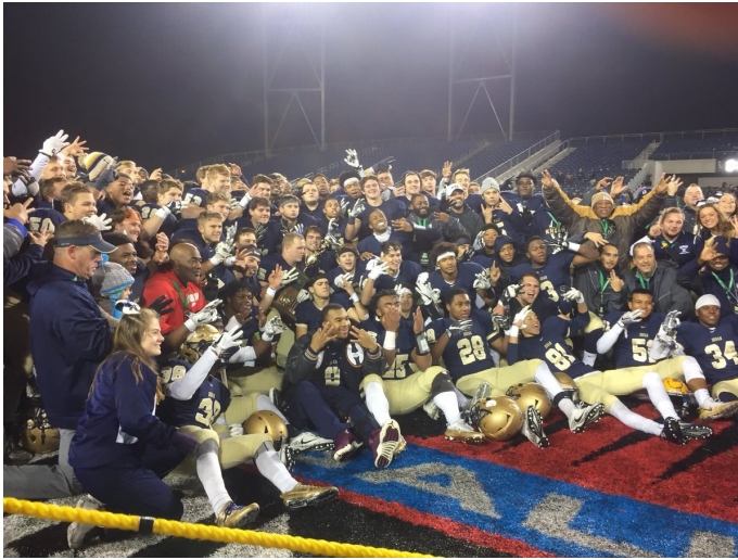
Archbishop Hoban players and fans celebrate their 3rd Consecutive OHSAA State Championship at the Tom Benson Hall of Fame Stadium in Canton, OH.

At the December 12, 2017 Council Meeting, County Council recognized Archbishop Hoban High School for their 3rd Consecutive Ohio High School Athletic Association Football State Championship.