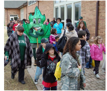
Kids and families walk in a Let's Move Fall Hike at Goodyear Heights Metro Park.

Let's Move Summit County is hosting its 3rd Annual Health Walk, on Saturday May 28, from 8:00a.m. to 1:00p.m. The walk route this year will begin and end at the Akron Zoo, located at 500 Edgewood Avenue.